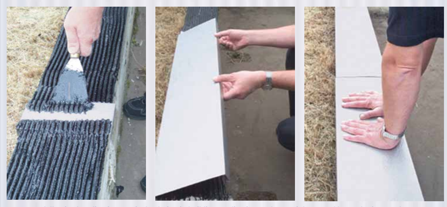
Adhesive bonding is practical solution in building applications, when stainless steel has to be fastened to masonry or natural stone.