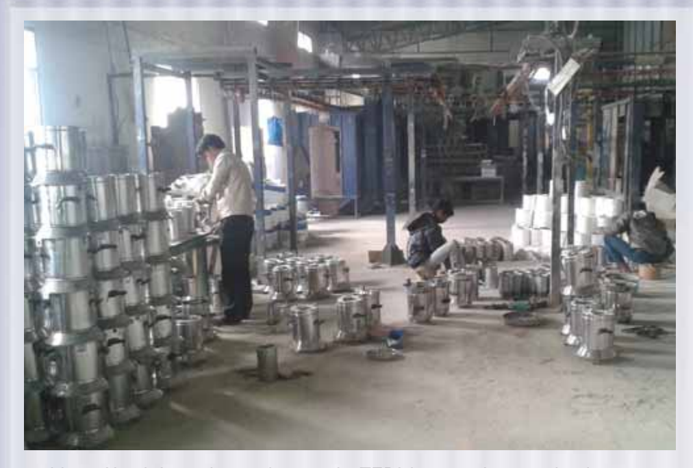
problem. Also it is easier to clean and wash the stove with just water or simple detergent.

Some typical advantages of this stove compared to tradition mud stove / three stone fires (subject to appropriate manufacturing and usage) are listed below